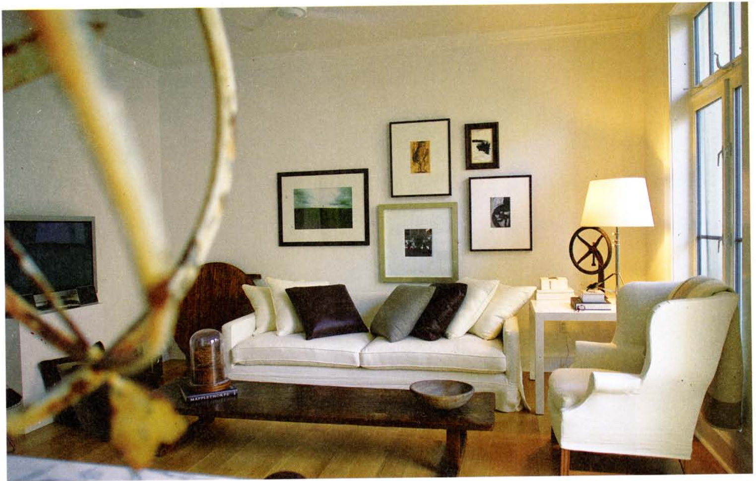
Cool, distinct furnishings define interior spaces at Almeria Row. BELOW (from left): Entrances to Almeria Row residences require passage through coral-stone columns and architraves. Private courtyards are surrounded by raphis palms, guava trees and bamboo. A coral-stone bench beneath an Asian waterfall is a perfect spot to relax quietly.