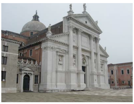
San Giorgio Maggiore, Venezia