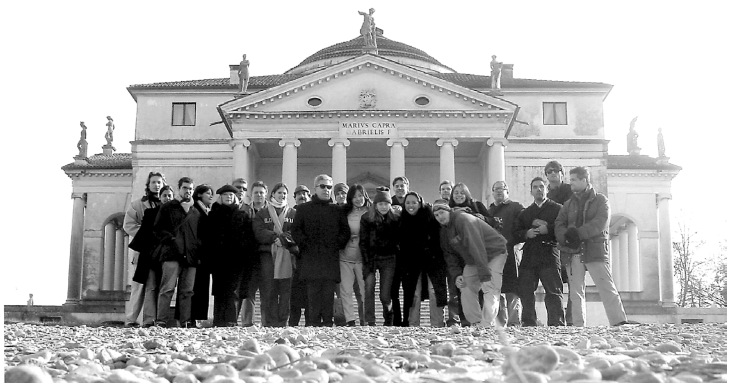
University of Miami Palladio Journey, 2001